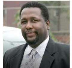
Wendell Pierce Actor, Treme and The Wire Special Guest