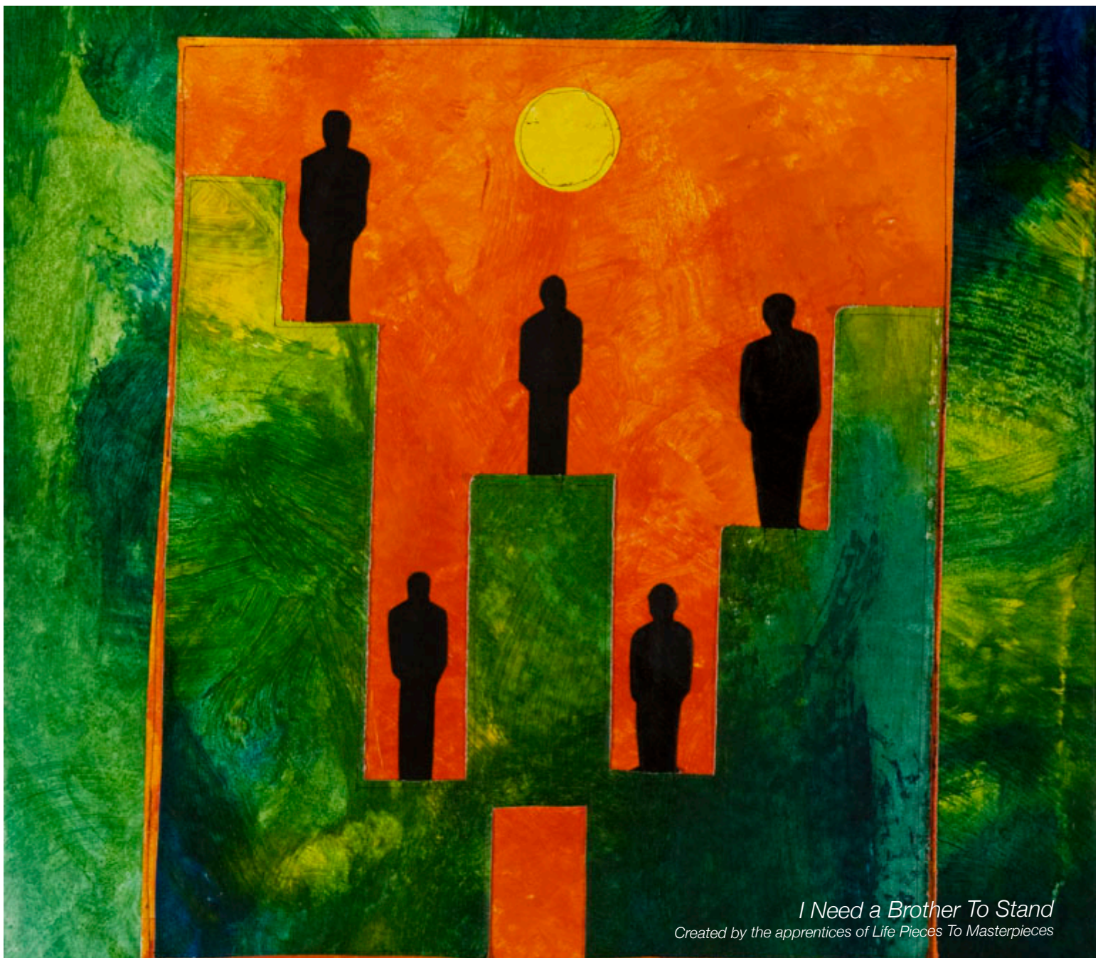
I Need a Brother To Stand Created by the apprentices of Life Pieces To Masterpieces

Celebrating 15 years of Creating Art and Changing Lives™