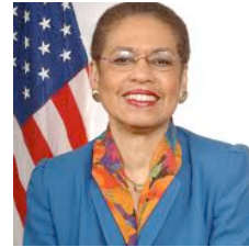
Congresswoman Eleanor Holmes Norton Honorary Chair